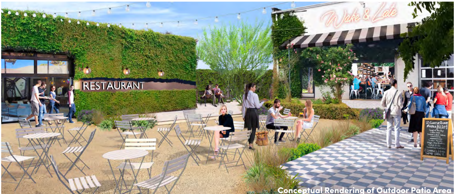
Conceptual Rendering of Outdoor Patio Area

CULLEN DONOHUE cullen.donohue@streamrealty.com 817.877.1305